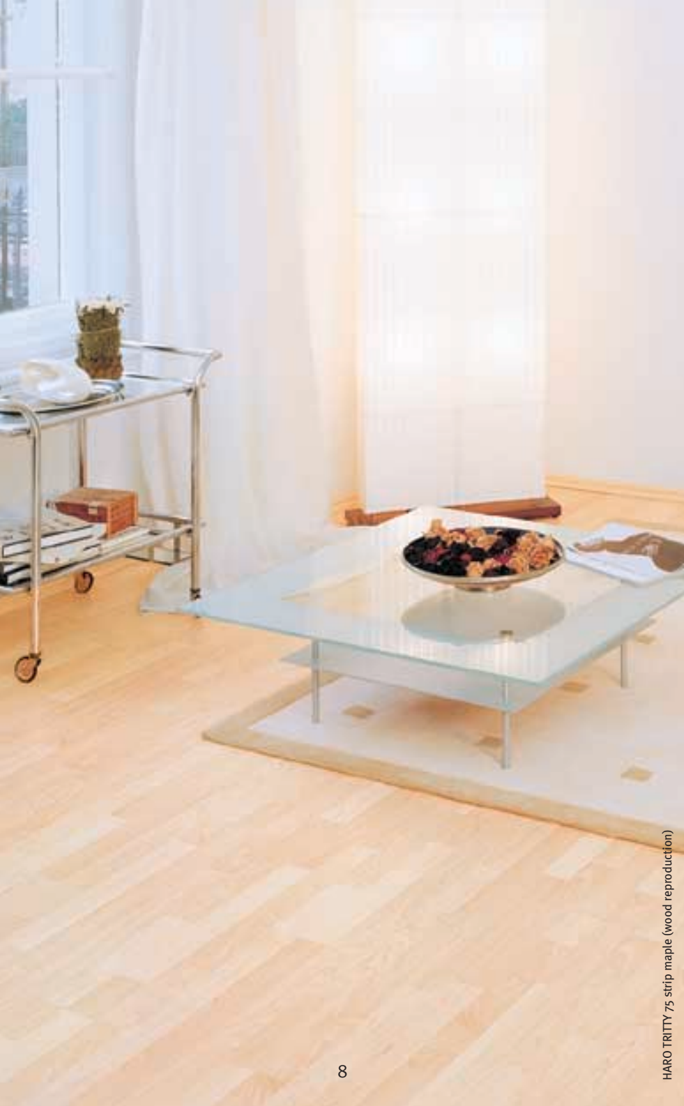
HARO TRITTY 75 strip maple (wood reproduction)