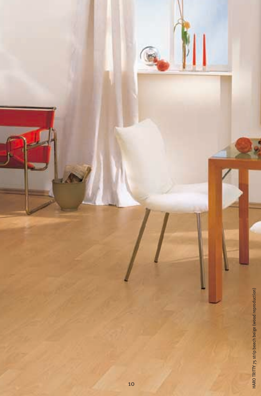
HARO TRITTY 75 strip beech beige (wood reproduction)