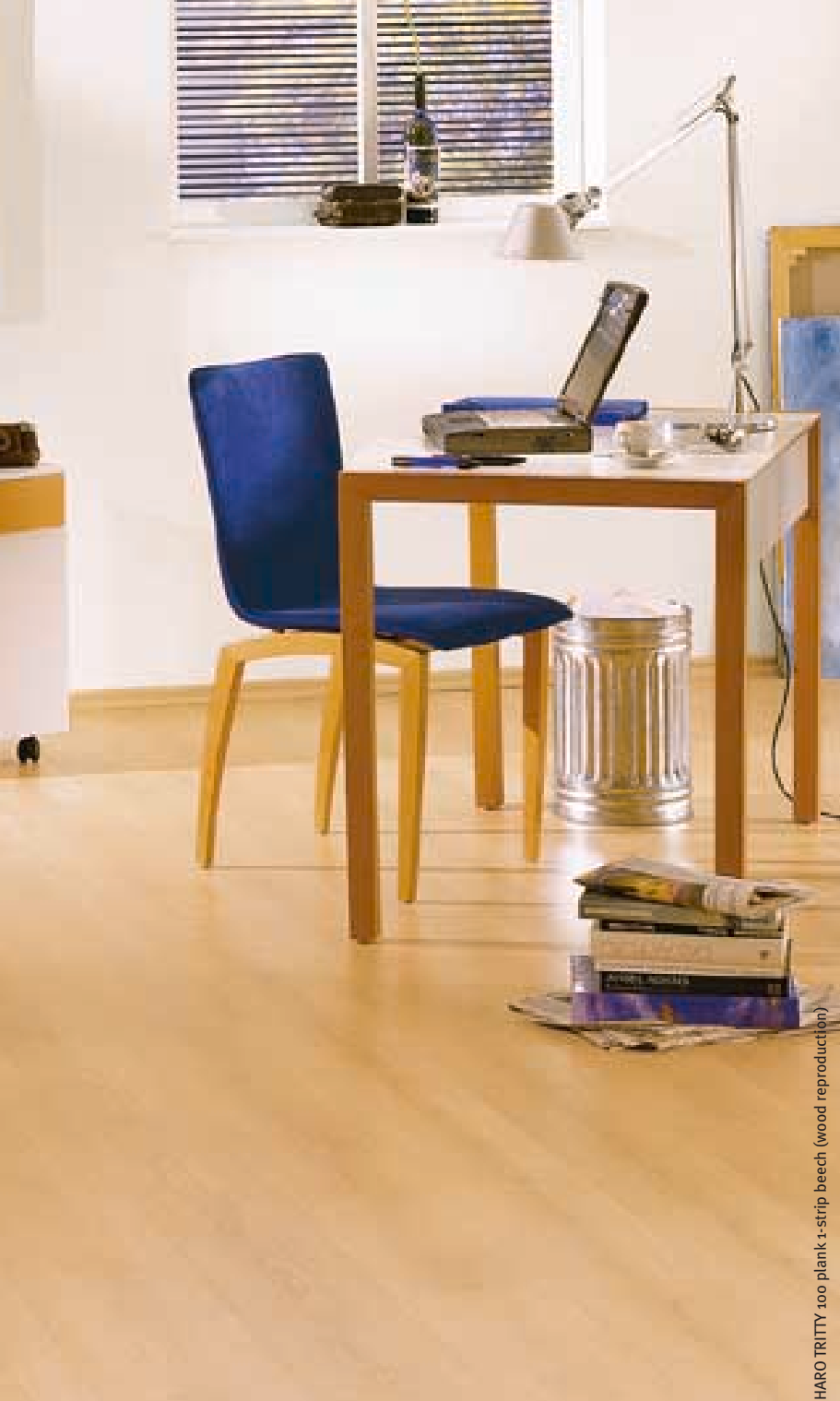
HARO TRITTY 100 plank 1-strip beech (wood reproduction)